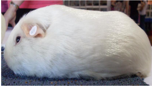
Dble Ch Canberry Ivana