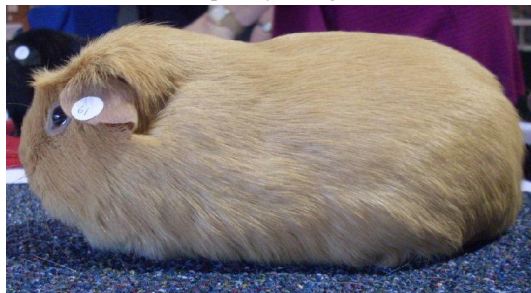
Dbl Ch Pigglylicious Pepita