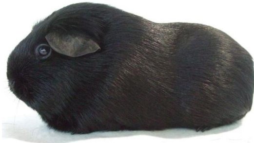
Suneagle Shadow Mist