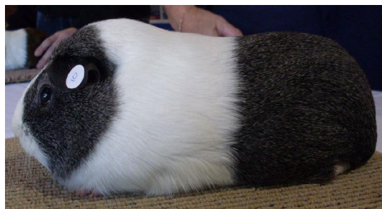
Clover-Leaf Summer Royal