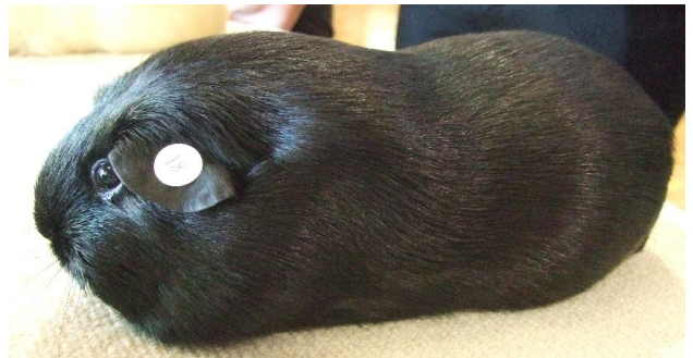
Double Header Show 5/6/11 RESERVE IN SHOW Tabella Jette (Self Black) R Ganon

Please note there will be a General Meeting at the 12:30 at the 2 nd July Show to discuss the Proposals for the ANCC meeting.