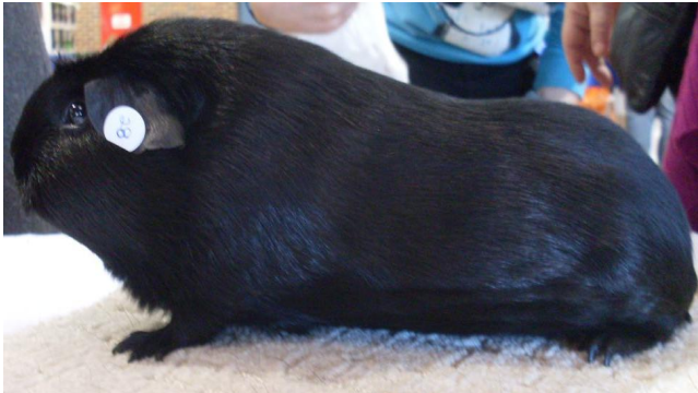
Anniversary Show 5/6/11 RESERVE IN SHOW Xqizit by Design (Crested Black) S Scott