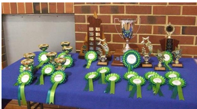
Trophy table at the Anniversary Show

It was while researching the above article that I found that a Vet who specialised in teeth, stated that it was very important for both Rabbits and Cavies to have a diet based on grass. There was a very noticeable difference between those people who fed their rabbits and/or cavies mostly fruit and vegetables and those who fed mostly grass. The grass feeders had a much less problems with the teeth of their pets than the fruit and vegetables feeders. “Food” for thought! I have to say that I have found this to be true of my stud. I have very few cavies with teeth troubles, even though I have about 200 cavies. The bulk of my cavies entire diet is their daily feed of grass.