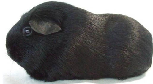
Suneagle Shadow Mist