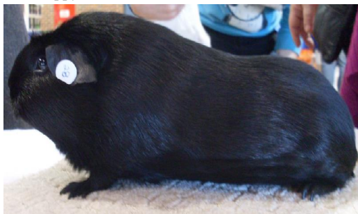
Xqizit by Design