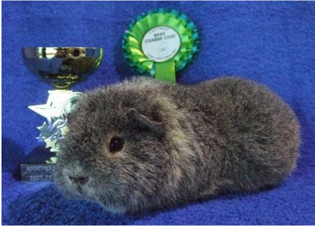
Anniversary Show 5/6/11 BEST IN SHOW Deas Fuzzy Wuzzy (Rex) S Deas