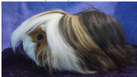
Peruv'n Ima Princess