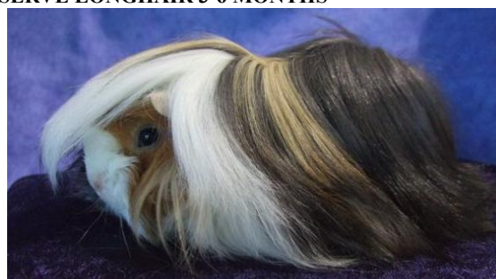
Peruv'n Ima Princess