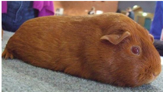
Wotamess Golden Magik