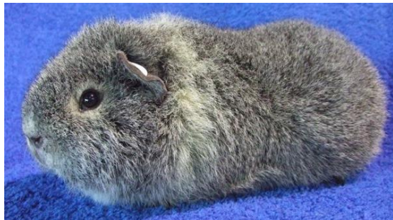
Deas Fuzzy Wuzzy