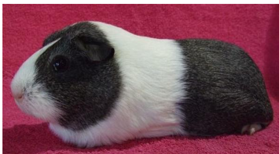
Clover-Leaf Summer Royal