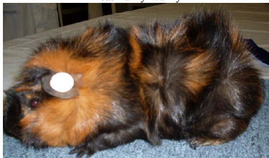
Wotamess Penny Regal