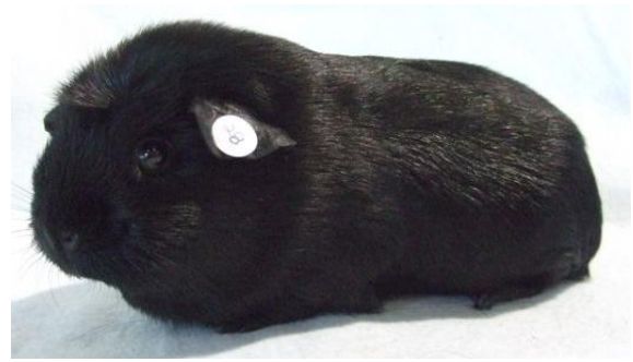
Xqizit By Design