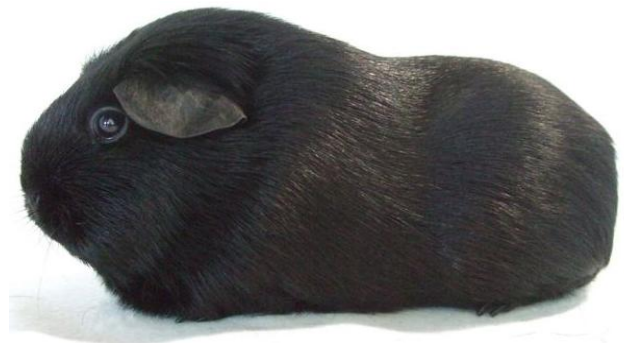
Double Header Show 5/6/11 BEST IN SHOW Suneagle Shadow Mist (Self Black) R Ganon