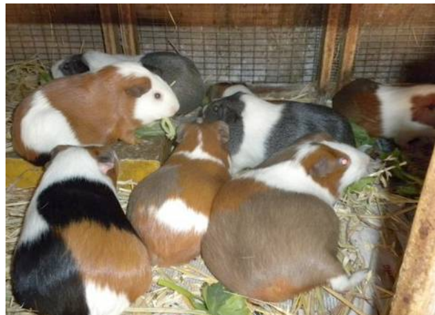
Some Clover-Leaf Sows