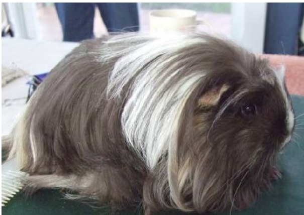
Young Stock Show – 28/3/10 RESERVE IN SHOW Suneagle Carmen (Coronet) A Hazelgrove