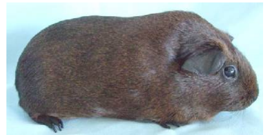
Suneagle Glow Girl