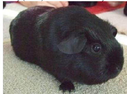
Tabella Breaking Dawn