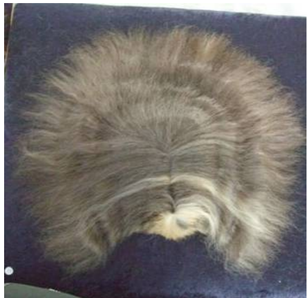
Club Show - 28/3/10 RESERVE IN SHOW Tabella Fruit Tingles (Merino) K Walter