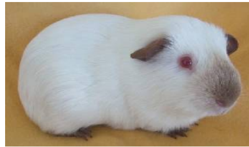
Sathra King Size

Cavy Comment – The Official Newsletter of Cavy West