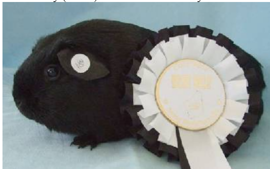
Tabella Breaking Dawn

Golden Agouti 3-6 (1) 1 BOB Suneagle Glow Girl A Hazelgrove BEST TICKED Suneagle Glow Girl (Golden Ag) A Hazelgrove RESERVE TICKED - BEST TICKED 6-9 MONTHS - RESERVE TICKED 6-9 MONTHS - BEST TICKED 3-6 MONTHS Suneagle Glow Girl (Golden Ag) A Hazelgrove RESERVE TICKED 3-6 MONTHS -