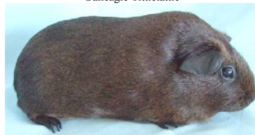
Suneagle Glow Girl