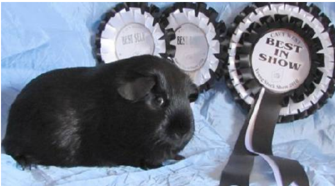
Young Stock Show - 28/3/10 BEST IN SHOW Tabella Breaking Dawn (Self Black) K Walter