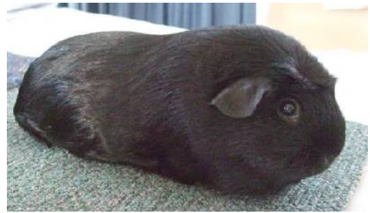
Suneagle Chitter Chatter