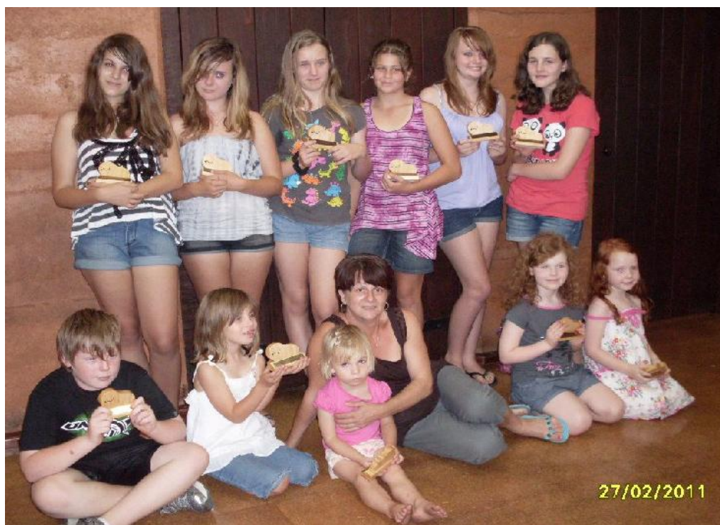
The Juniors with their loot